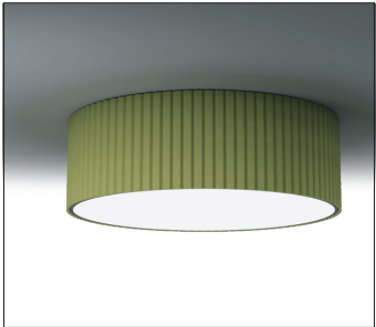
SF - SURFACE MOUNT