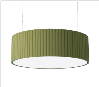
FR - FLUSH REGULAR