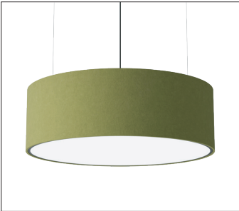
FV - FLUSH VCUT