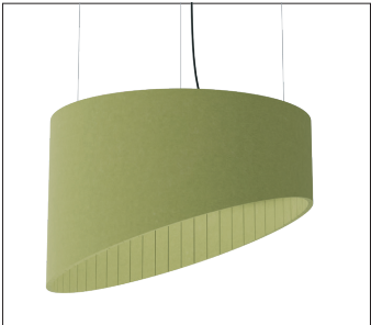
RA - RECESSED ANGLE