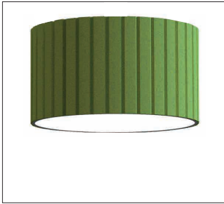
SF - SURFACE MOUNT