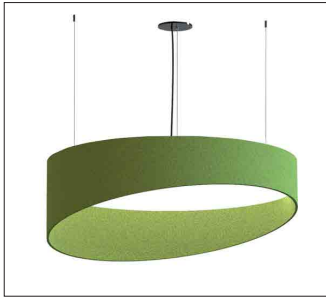
RA - RECESSED ANGLE