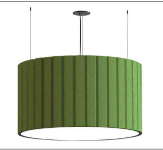
FV - FLUSH VCUT