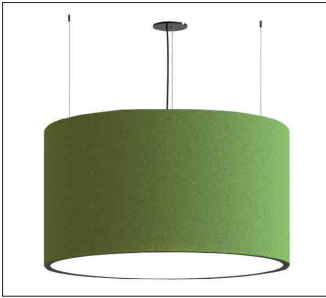
FR - FLUSH REGULAR